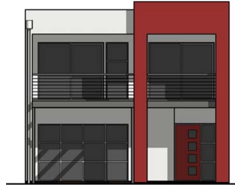
Front view Individually designed for your style and block requirements